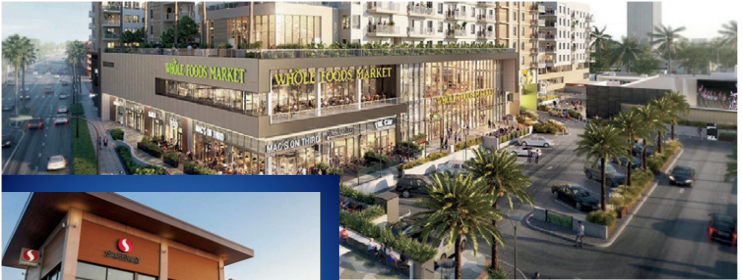
Bloom on Third | Los Angeles, CA