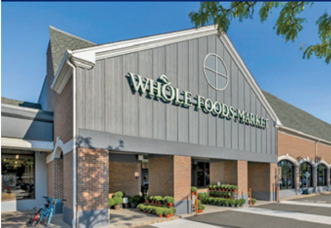
Valley Ridge Shopping Center | Wayne, NJ