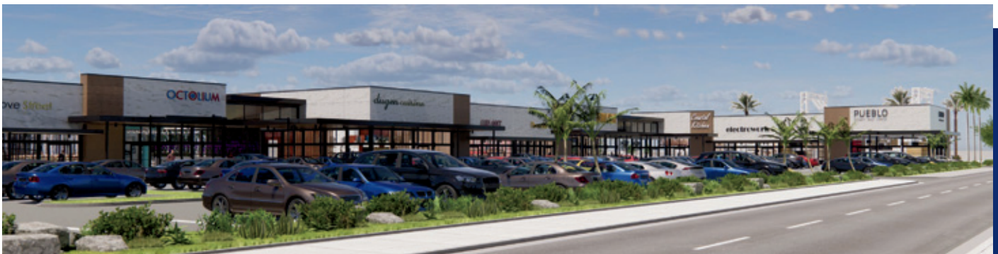
Avenida Biscayne | Aventura, FL

In-Process Projects at Year- end at Yields of ~8% and nearly 90% Leased