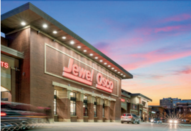
Old Town Square | Chicago, IL