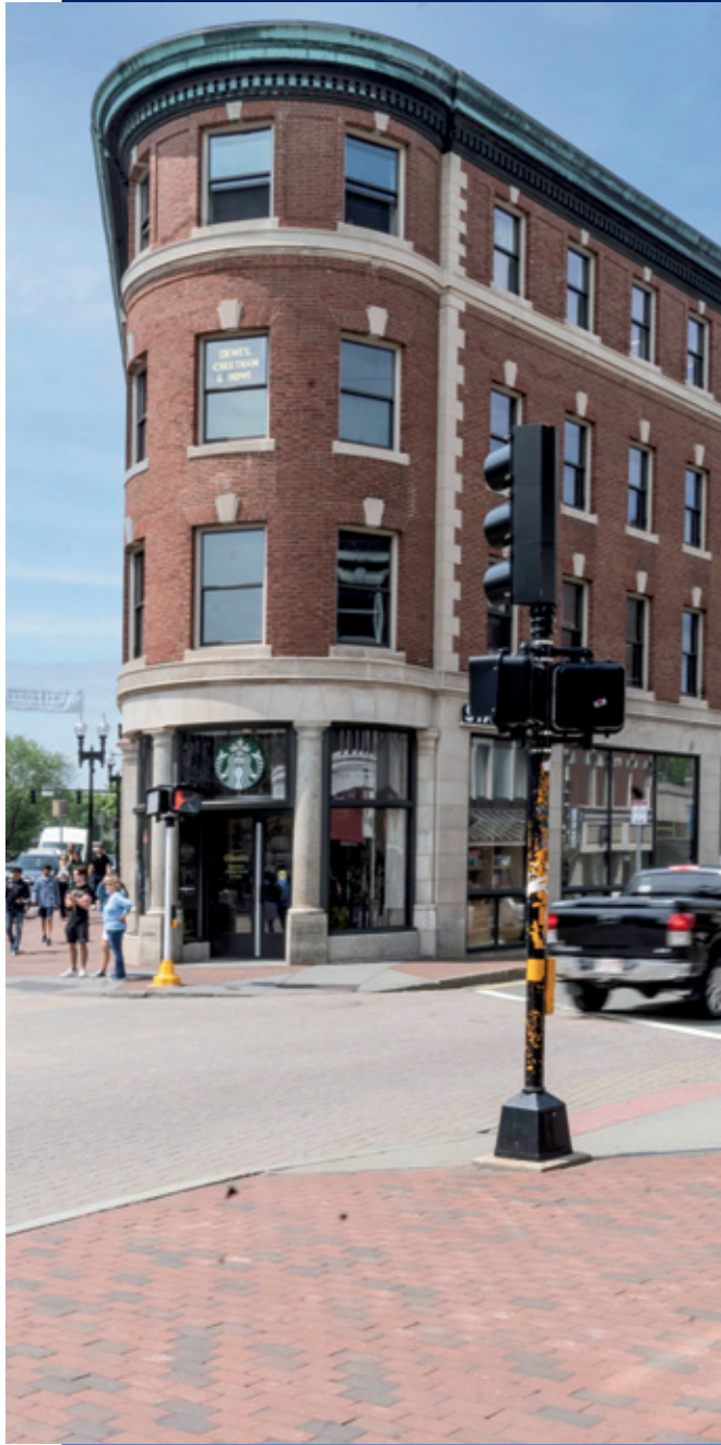
The Abbot | Cambridge, MA