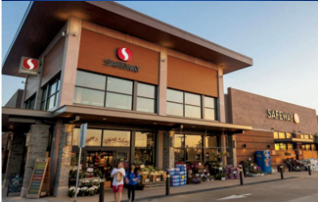
Grand Ridge Plaza | Issaquah, WA