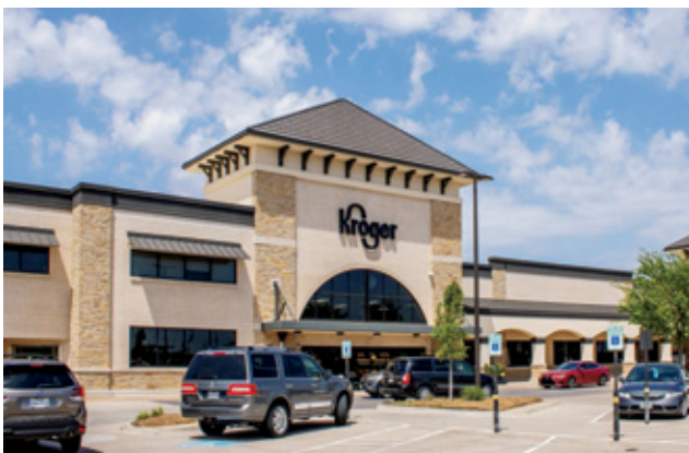
The Village at Riverstone | Sugar Land, TX

3.8% Dividend CAGR (compound annual growth rate) since 2014