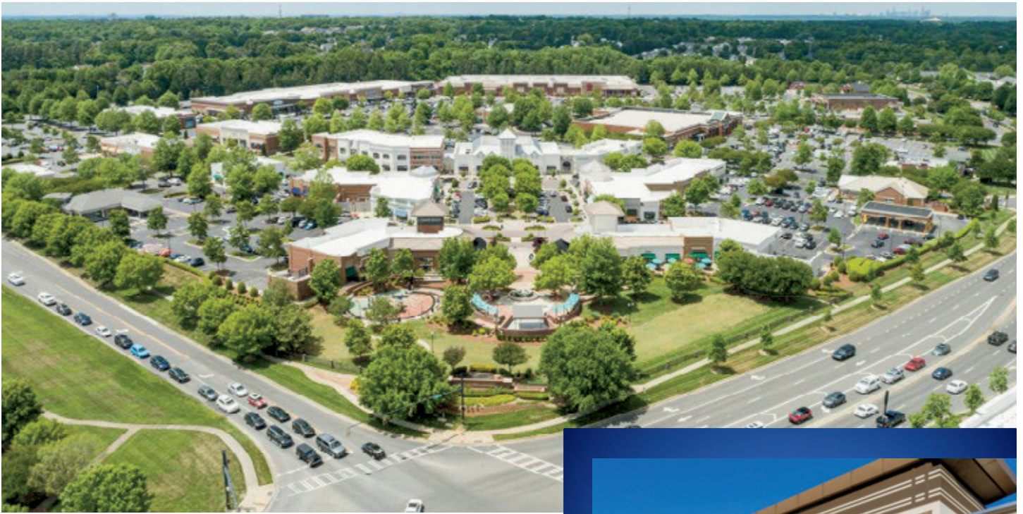
Blakeney Town Center | Charlotte, NC