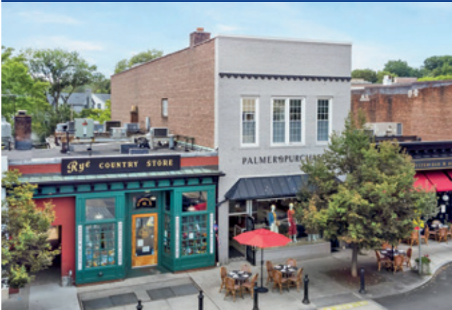
Purchase Street | Rye, NY