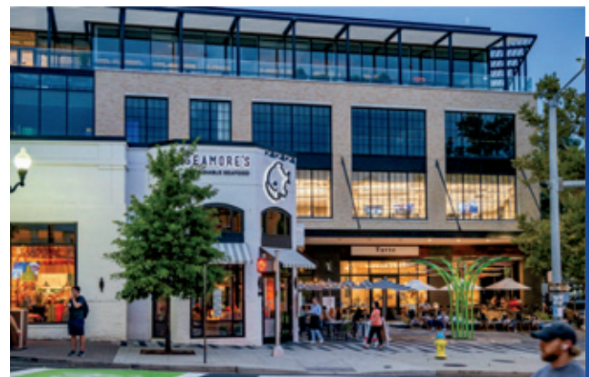
The Crossing Clarendon | Arlington, VA