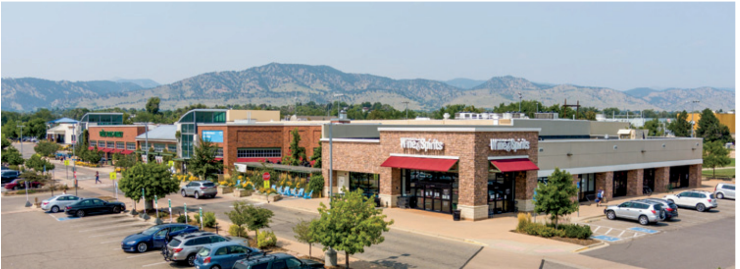
Crossroads Commons | Boulder, CO