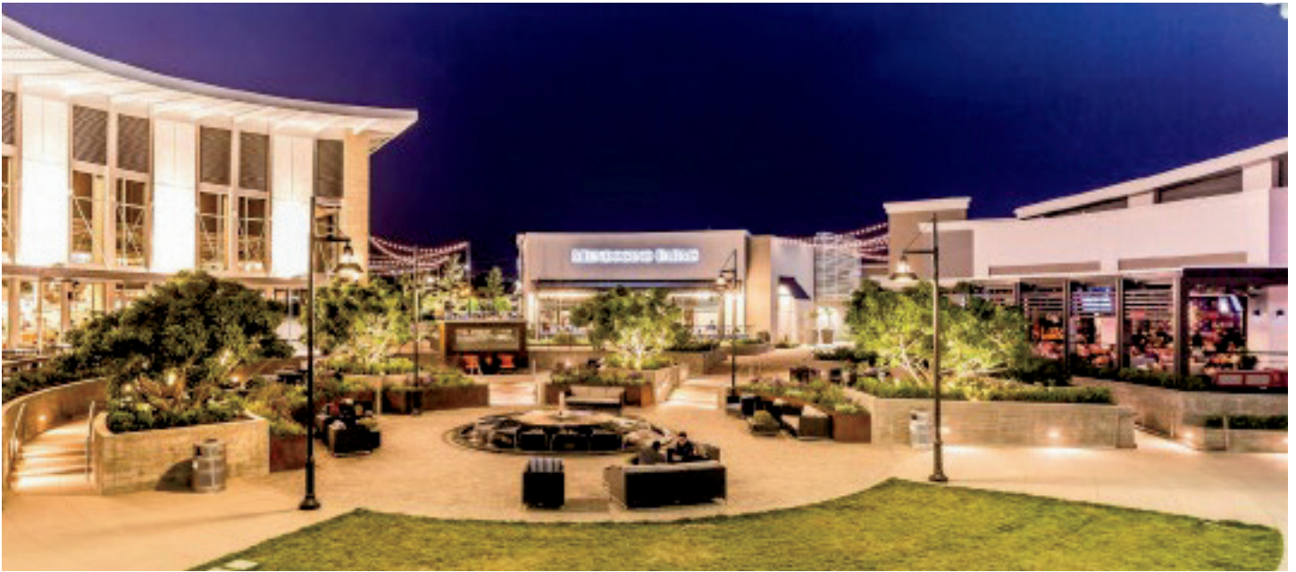
Village at La Floresta | Los Angeles, CA

Lastly, but importantly, Regency's success and accomplishments in 2023, and over the last 60 years, would not have been possible without the unwavering support of all our stakeholders. We are grateful for the continued commitment and engagement that our investors, tenants, joint venture partners, service providers, communities, Board of Directors and talented team have provided us over the last 60 years. We thank you for your loyalty and look forward to sharing many more years of success together.