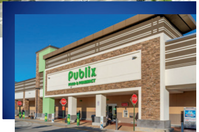
Countryside Shops | Ft. Lauderdale, FL

Core Operating Earnings per share Growth in 2023